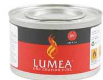
Lumea Gel Chafing Fuel 2 hour +

Lumea Chafing Fuel can be used in most food and beverage heating units including beverage urns, soup tureens and chafing dishes. When the pressure is on, you can rely on the safe heat of Lumea Chafing Fuel.