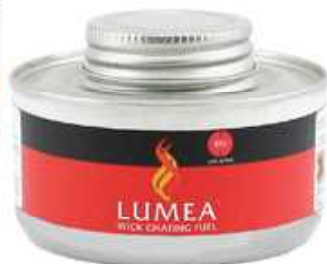
Lumea Wick Chafing Fuel 4 hour +