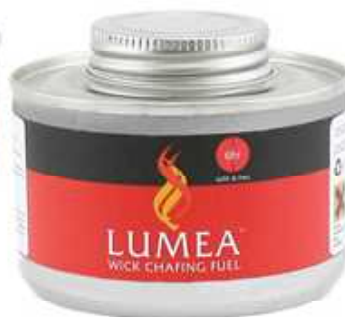
Lumea Wick Chafing Fuel 6 hour +